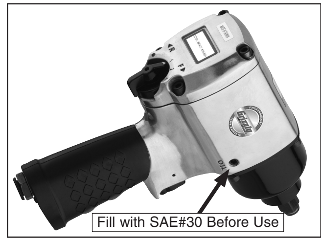
Figure 1. Model H6187

Install \frac{1}{2} " drive socket onto your impact wrench. Use only impact wrench sockets. Choose from clockwise (F) to tighten, or counterclockwise (R) to loosen by turning the direction switch ( Ref # 41 ). Forward torque can be set from 1-3.